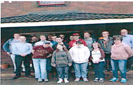
Destined – Outreach Clinic Sep 2016