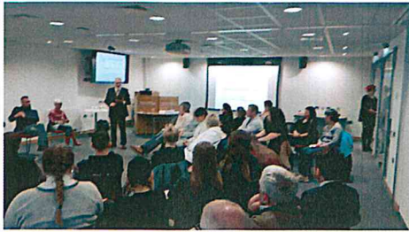
Stormont Hustings Apr 2016