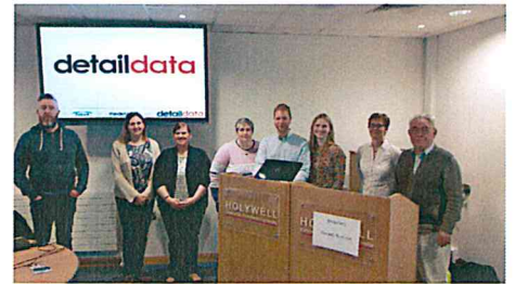
Detail Data Apr 2016