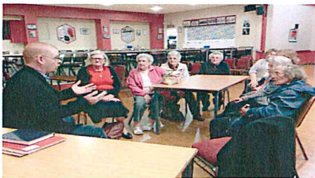
Plum Club – Outreach Clinic July 2016