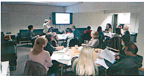
CCNI & Foyle BME Collective May 2016