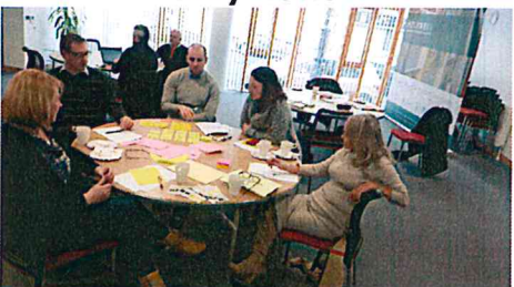
Social Innovation Decoded Dec 2016