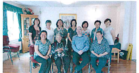
Active Citizens Engaged – Outreach Clinic July 2016