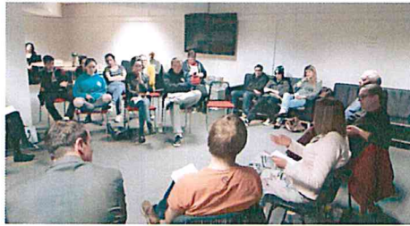
Stormont Hustings – The Young Person’s Voice, Apr 2016