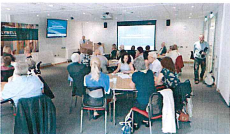
Programme for Government Consultation July 2016