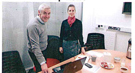
Member Fundraising Clinics Mar 2017