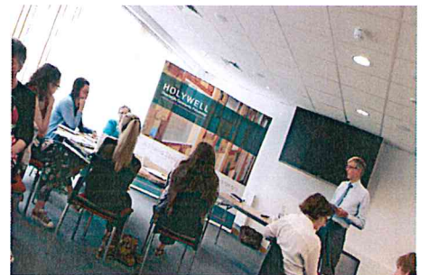
Department of Infrastructure Consultation Sep 2016